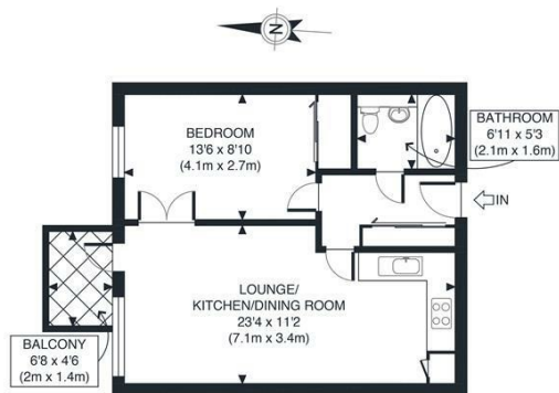
GROUND FLOOR GROSS INTERNAL FLOOR AREA 476 SQ FT